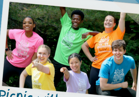
Picnic with Patchwork!